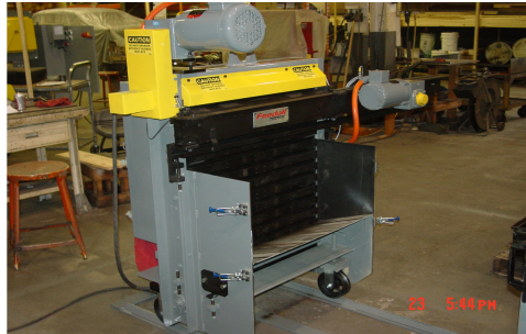
Model 3000 Elevator