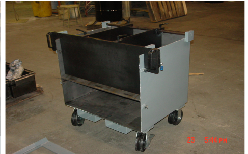
Model 3000 Detachable Base

FEEDALL's Model 3000 Hopper Feeder for Centerless Grinding handle all kinds of different sizes and shapes that need to be O.D. ground. Loading – no problem! Flexibility in design allow FEEDALL to provide a detachable base that can be off-loaded from a previous operation and auto loaded your FEEDALL ! . If you are Centerless Grinding and your volumes require a feed system, FEEDALL has your parts feeding problem handled! FEEDALL's are built to run 24 hours a day, 7 days a week! The HIGH QUALITY craftsmanship and FLEXIBLE design set us apart from the completion. Since 1946, FEEDALL has provided parts feeding solutions that not only meet, but exceed our customer's expectations! Contact FEEDALL at 440-942-8100 or visit our website at www.feedall.com to find your local FEEDALL Sales Representative. We look forward to the opportunity to show you how we can not only solve your parts feeding problems, but more importantly, increase your bottom line!