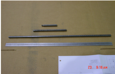
Shafts to be Ground