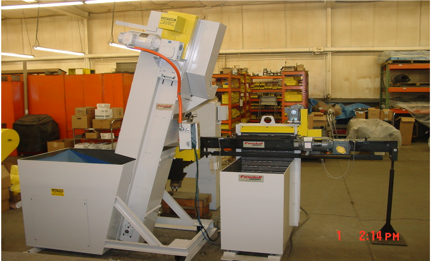
FEEDALL Model 2400-D w/Model 2000 to feed Piston Rings and Valve Guides into Centerless Grinder