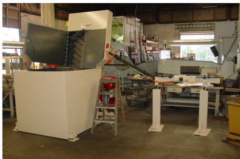
FEEDALL Model 2500-C