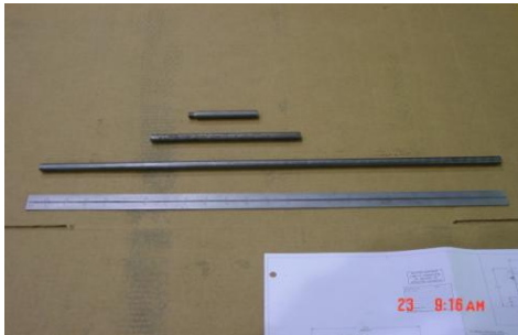
Shafts to be Ground