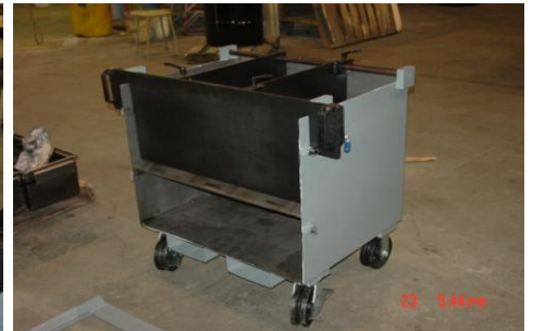
Model 3000 Detachable Base

FEEDALL's Model 3000 Hopper Feeder for Centerless Grinding handle all kinds of different sizes and shapes that need to be O.D. ground. Loading – no problem! Flexibility in design allow FEEDALL to provide a detachable base that can be off-loaded from a previous operation and auto loaded your FEEDALL ! . If you are Centerless Grinding and your volumes require a feed system, FEEDALL has your parts feeding problem handled! FEEDALL's are built to run 24 hours a day, 7 days a week! The HIGH QUALITY craftsmanship and FLEXIBLE design set us apart from the completion. Since 1946, FEEDALL has provided parts feeding solutions that not only meet, but exceed our customer's expectations! Contact FEEDALL at 440-942-8100 or visit our website at www.feedall.com to find your local FEEDALL Sales Representative. We look forward to the opportunity to show you how we can not only solve your parts feeding problems, but more importantly, increase your bottom line!