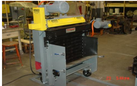
Model 3000 Elevator