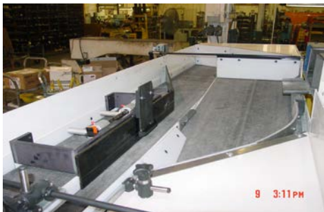
Gentle Handling Orienting Conveyor